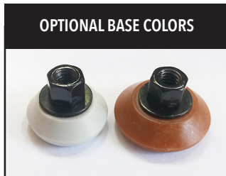
OPTIONAL BASE COLORS