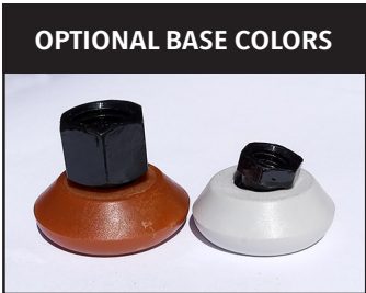
OPTIONAL BASE COLORS