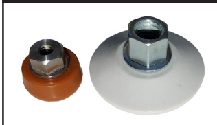
LOW PROFILE FIXED — METRIC SOCKET LEVELERS