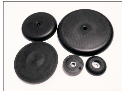
NON-SKID GRIPPER PADS ( WITHOUT WASHER)

IEC's wood screw non-skid gripper pads protect floors and reduce sliding. They have a black non-marring thermo-plastic rubber (TPR) base. They can also use sheet metal or machine screws, rivets, etc.