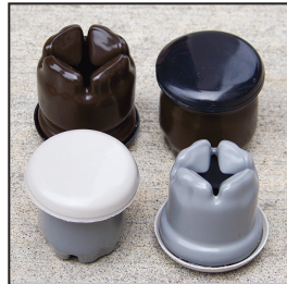
SLIP ON SLIDERS

The brown slip-on sliders have a black base and the grey slip-on sliders have an off-white base. Also available with felt base. (See Slip-on felt section).