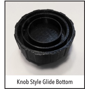
Knob Style Glide Bottom