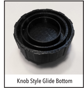
Knob Style Glide Bottom