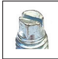
Top Hex (-HX) and Slot (-SL)