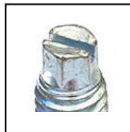
Top Hex (-HX) and Slot (-SL)