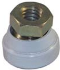
white base is delrin® plastic.