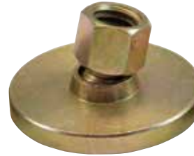
Nut Height: "G" = 1/2", 5/8", 11/16", 3/4" for Threads: 1/2-13, 5/8-11, 3/4-10, 1-8