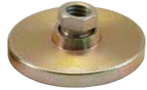
Nut Height: "G" = 3/16" for Threads: 1/4-20, 5/16-18, 3/8-16