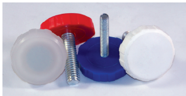
Many colors available as custom option.

For higher load ratings, more thread sizes in steel and stainless steel and top hex and slot features, see IEC's Knob Style Glides in our Medium Duty Leveler catalog.