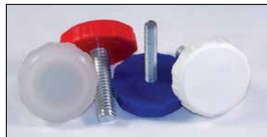
Many colors available as custom option.