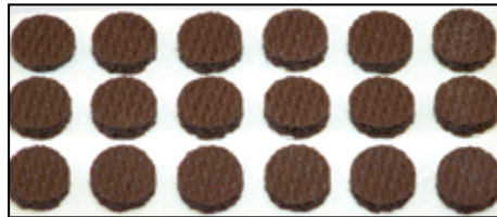
SPONGE RUBBER BUMPERS / CUSHIONS