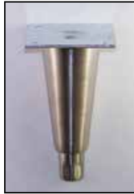
METAL — ADJUSTABLE LEGS

IL641 has a 3/8-16 thread. It comes with a nylon base threaded glide which provides 1-1/4" of height adjustment. You can also choose a different threaded leveler or caster for this leg. Load rating, 500 lbs. or less.