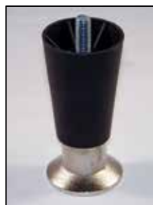
METAL — ADJUSTABLE LEGS