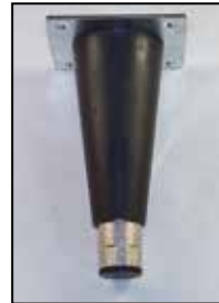
METAL — ADJUSTABLE LEGS