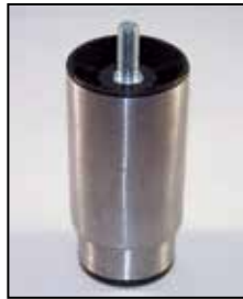
METAL — ADJUSTABLE LEGS